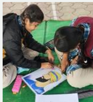
Children in National Bal Bhavan listening to the stories on valour and sacrifice of Sahibzades. Students participating in drawing competitions held in schools across the nation on Veer Baal Diwas.