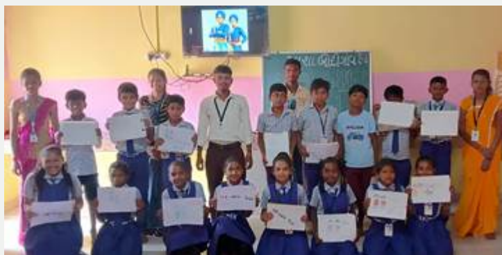
Students participating in poster making competition held to mark Veer Baal Diwas.

Ministry of Education in collaboration with MyGov also organised an interactive online quiz curated by CBSE which saw the participation of more than 1.3 lakh people nationwide. Students acquainted themselves with the inspiring lives and noble deeds of Sahibzadas.