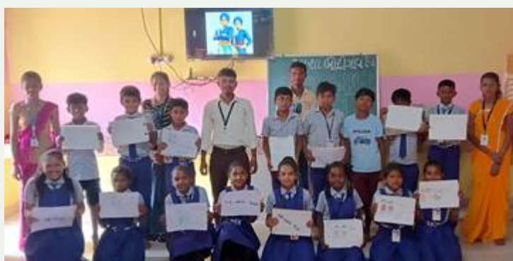
Students participating in poster making competition held to mark Veer Baal Diwas.

Ministry of Education in collaboration with MyGov also organised an interactive online quiz curated by CBSE which saw the participation of more than 1.3 lakh people nationwide. Students acquainted themselves with the inspiring lives and noble deeds of Sahibzadas.