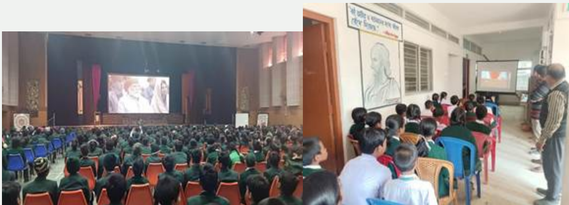
Students watching the nationwide live broadcast of Veer Baal Diwas 2023.

The Prime Minister, Shri Narendra Modi participated in a program marking 'Veer Bal Diwas' at Bharat Mandapam, New Delhi today and witnessed a recital and three martial arts displays performed by children. Addressing the gathering, the Hon'ble Prime Minister remarked that the nation is remembering the immortal sacrifices of Veer Sahibzade and deriving inspiration from them as a new chapter of Veer Bal Diwas unfolds for India in the Azadi Ka Amrit Kaal. Students & teachers in huge numbers watched the live telecast of the programme.