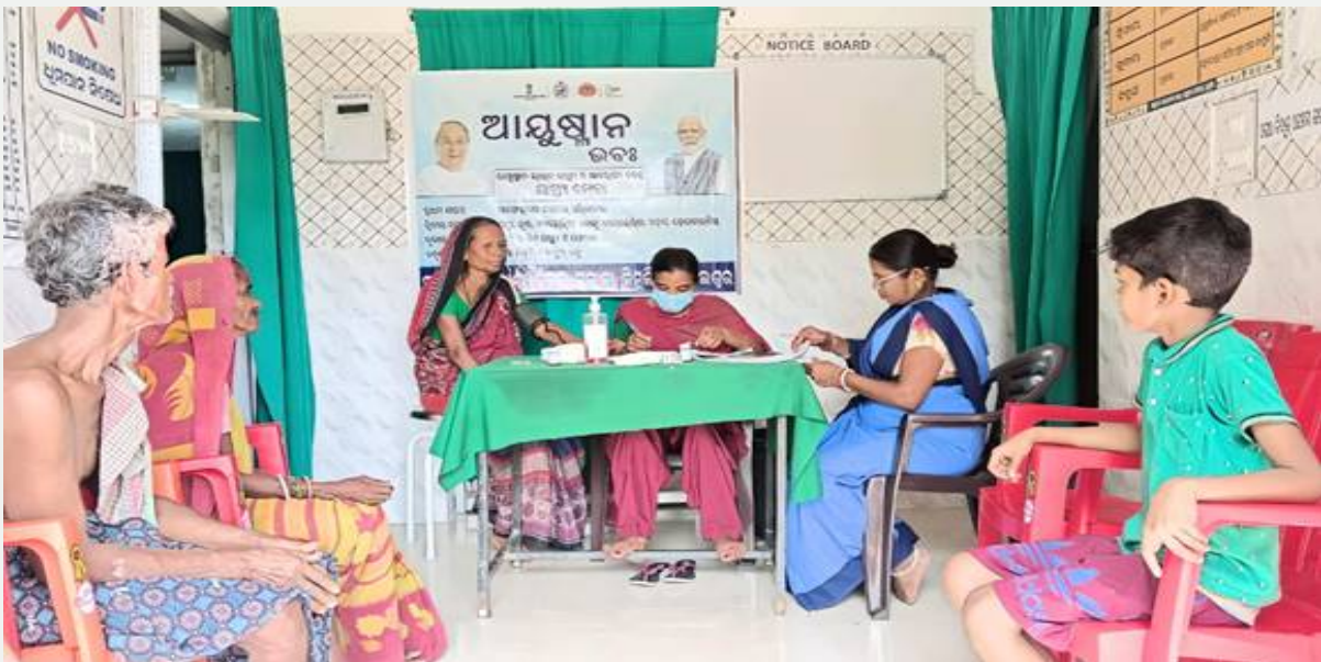
Ayushman Bhav Health Mela organized in Odisha