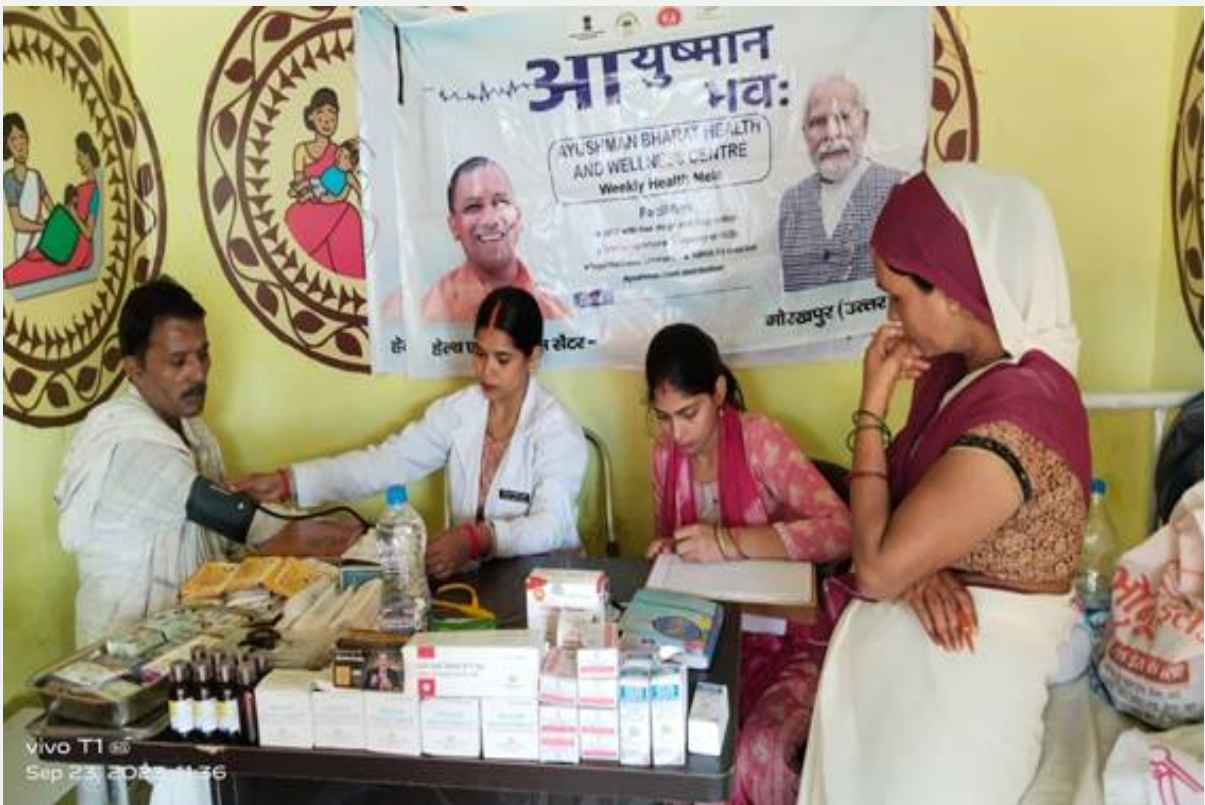
Ayushman Bhav Health Mela conducted in Uttar Pradesh