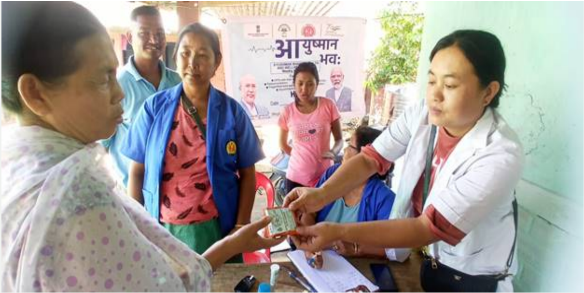
Ayushman Bhav Health Mela conducted in Manipur