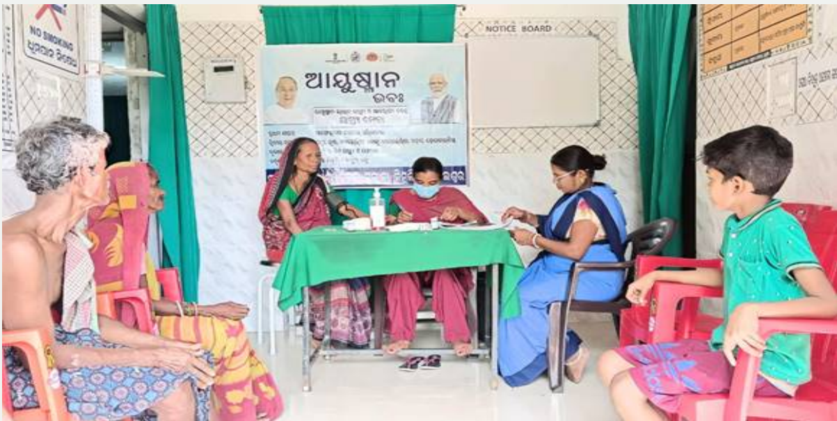
Ayushman Bhav Health Mela organized in Odisha