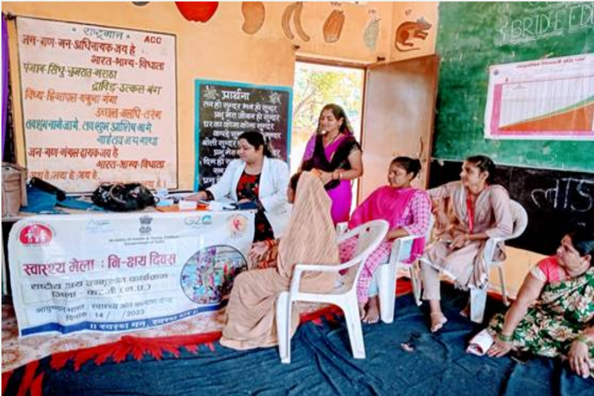
Ayushman Bhav Health Mela Organized in Madhya Pradesh